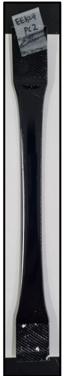
200% Elongated Hard Coated Product